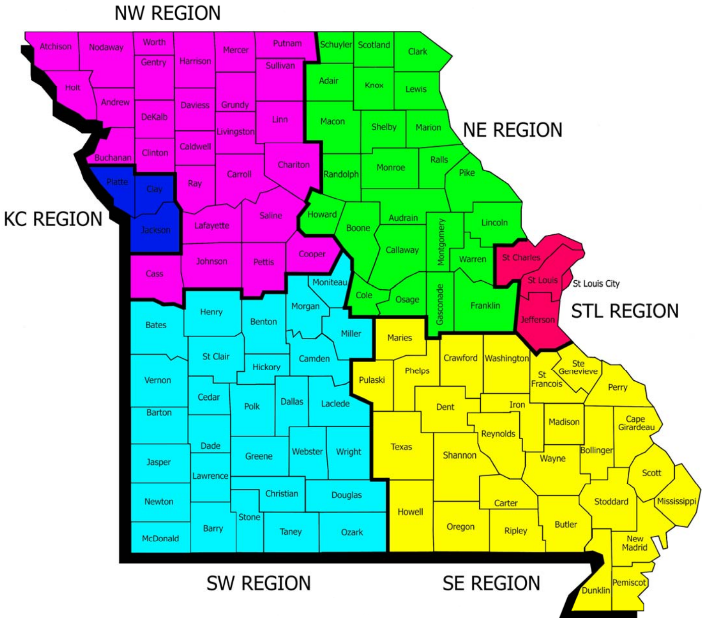
Figure 1 Department of Social Services Regions